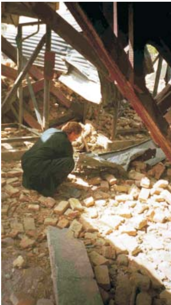
Figure 2. Soil and debris samples being collected from the bombing site by the Uranium Medical Research Center's (UMRC) field team during the second field trip outside Bibi Mahro district, Afghanistan, 2002.

Uranium levels in the soil samples from the areas of OEF bombsites were two to three times higher than worldwide concentration levels of 2-3 mg/kg. The